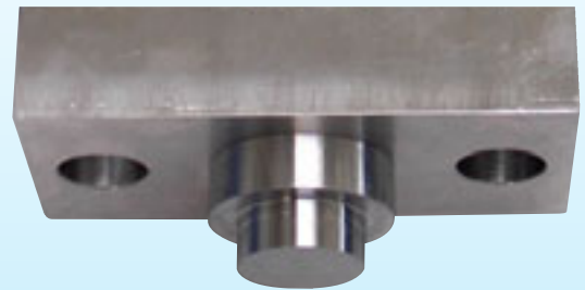
Unbreakable diaphragm !

Features include: microprocessor control, easy operation using 3 push buttons and display without test pressure, adjustable damping and a complete stainless steel housing for the electronics.