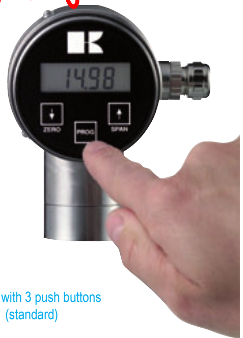
Display with 3 push buttons (standard)