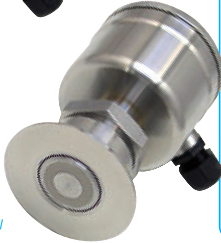
Flush with inside tankwall