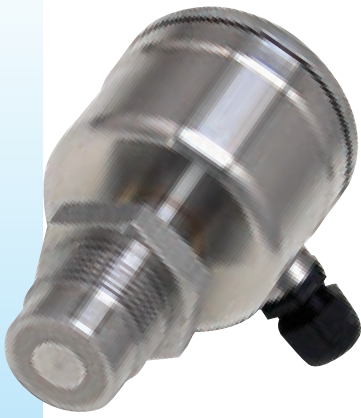
G1" thread flush mounted (Code: FLX-S-S-Flush)