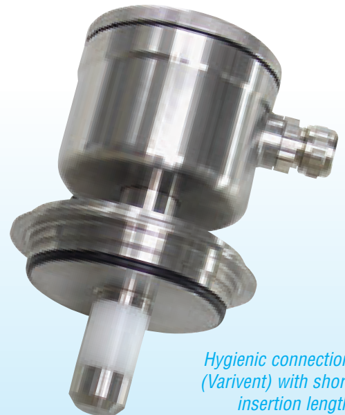
Hygienic connection (Varivent) with short insertion length

There are several executions available, like extended probes without electronics which can be shortened by the customer at any length, or our "flush" mounted version without insertion length (see page 2).