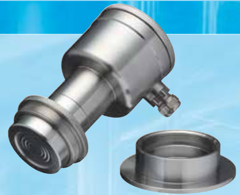
Code W: sanitary weld spud