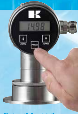
Display with 3 push buttons (Standard)